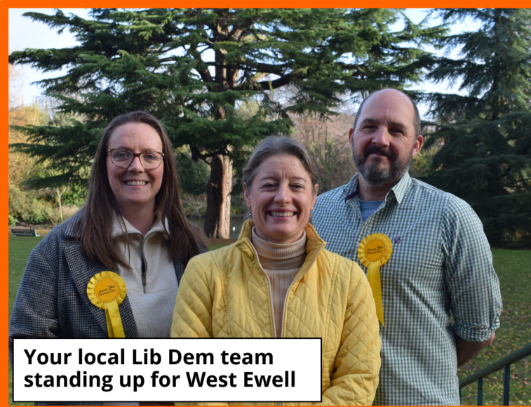
Your local Lib Dem team standing up for West Ewell