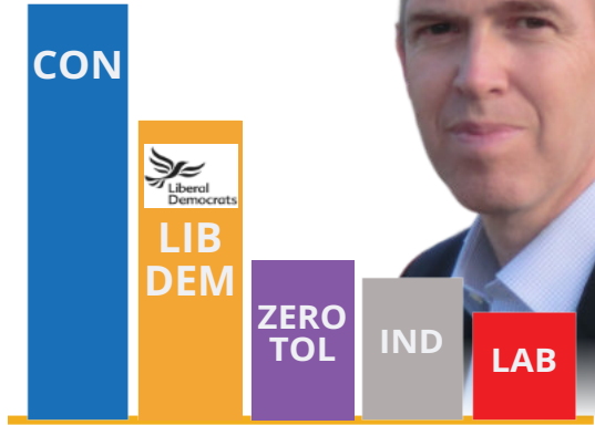
Final result, Surrey PCC election 2021

Police & Crime Commissioner election 2nd May