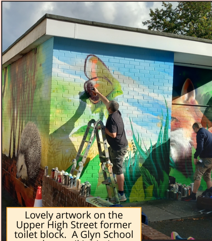
Lovely artwork on the Upper High Street former toilet block. A Glyn School and council initiative