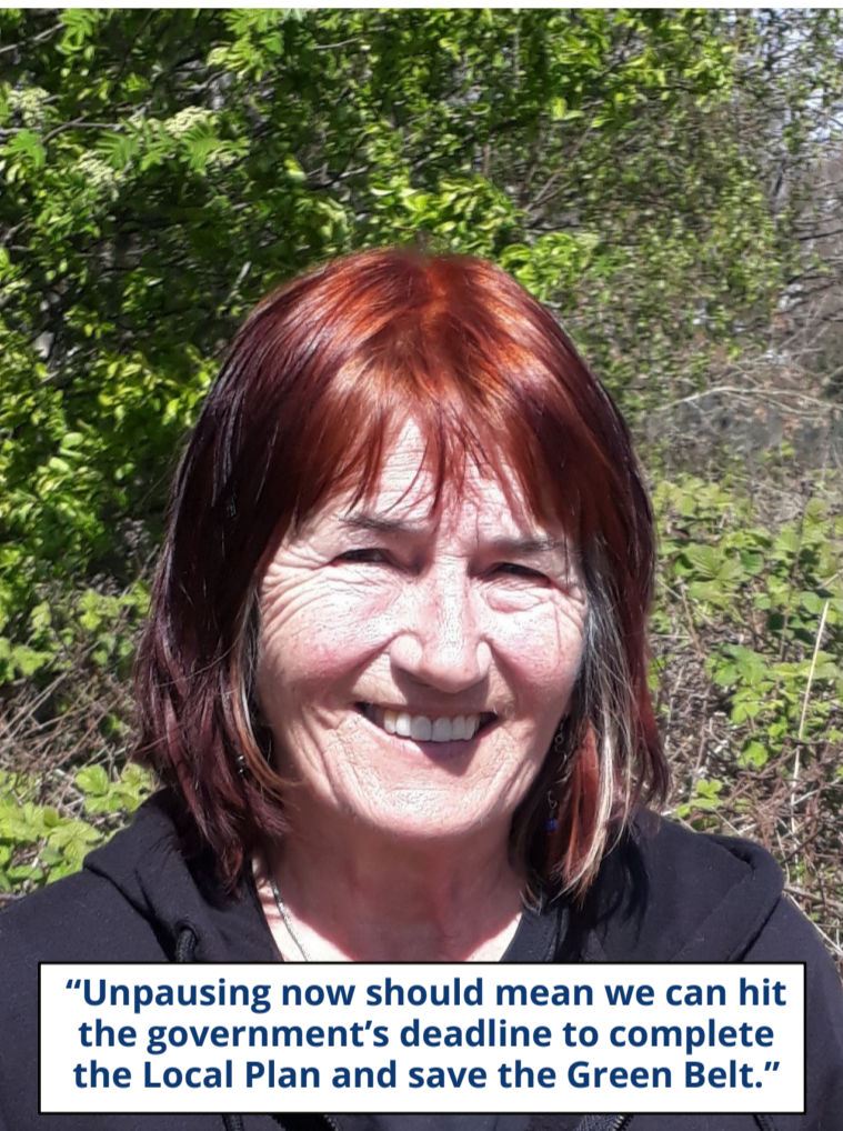
“Unpausing now should mean we can hit the government’s deadline to complete the Local Plan and save the Green Belt.”

Epsom & Ewell’s Local Plan process has been ‘unpaused’. It was paused just before the local elections in May after local Green Belt protests showed that the RA council could lose thousands of votes.