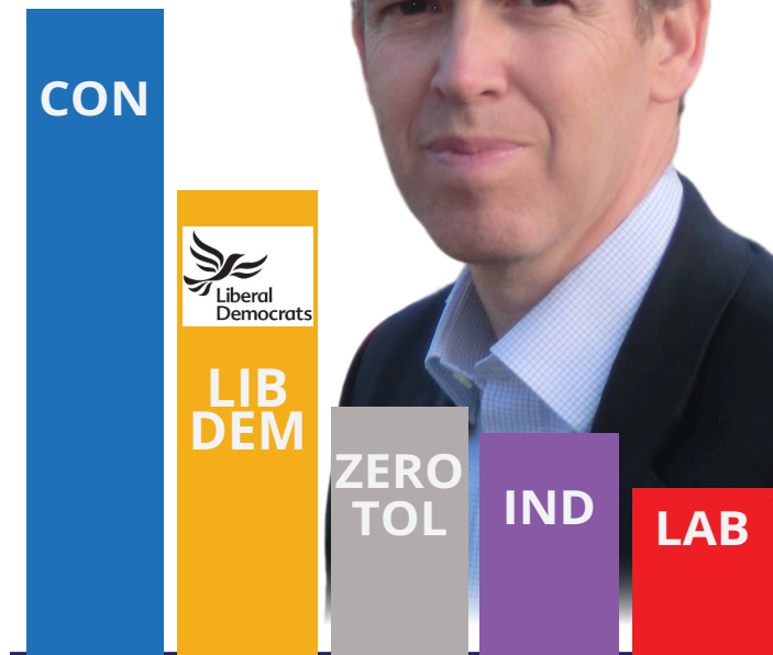
Final result, Police & Crime Commissioner election 2021