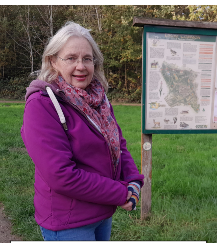
"Unpausing now should mean we can hit the government's deadline to complete the Local Plan and save the Green Belt."