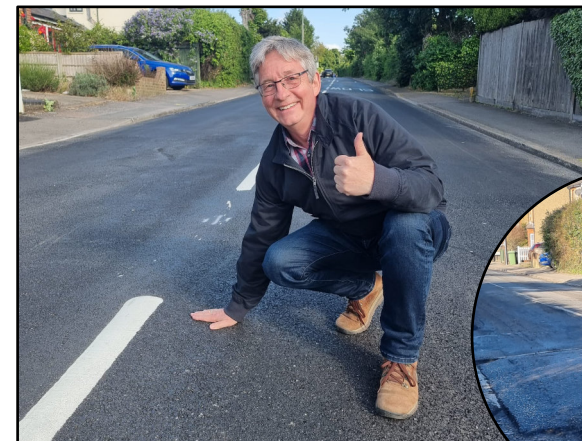
Burgh Heath Road as it was (right) and the smooth new surface (above)

The first meeting of the new Planning Committee has decided that the proposed flats on the corner of West Street and Station Approach can go ahead after the height was reduced from 12/13 stories to 6 and other issues raised by the Planning Inspectorate have been addressed. However, the applicants' own predicted view (above) shows that it will still have a visual impact from Fair Green and West Hill .